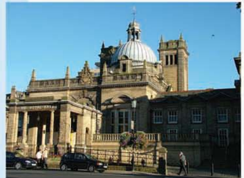
The Royal Baths

Harrogate International Centre – www.harrogateinternationalcentre.co.uk